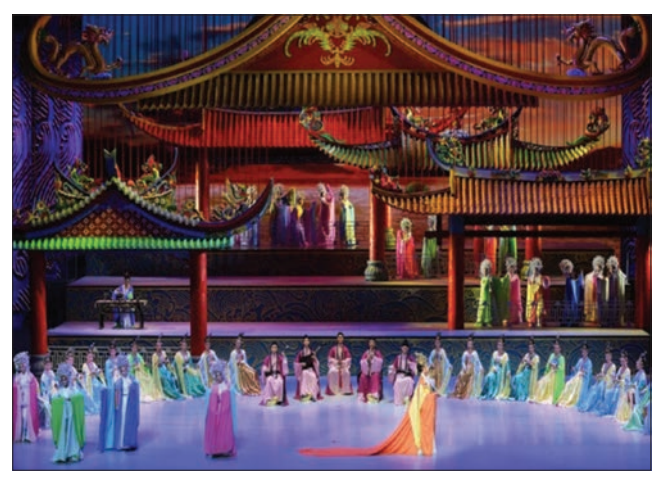
Figure 3. Performing Nanyin Song

Furthermore, the research aligned with theoretical principles in the field of musicology, shedding light on Nanyin's cultural significance and its crucial role in preserving China's traditional culture. The study emphasized Nanyin's potential for heritage education, offering opportunities to disseminate the exceptional traditional culture of Quanzhou Nanyin and contributing valuable insights to the realms of cultural studies and heritage education. Overall, Nanyin Performance Art's contribution to cultural studies and heritage education proves to be a compelling area for further exploration and appreciation of this invaluable cultural heritage.