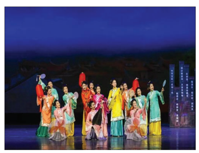
Figure 2. Singing Nanyin song

One of the significant findings was the diverse performance forms of Nanyin, which encompass various styles such as duet singing, chorus singing, enchant singing, rotating singing, and group singing. These performance forms demonstrated the artistic versatility and expressive capabilities of Nanyin as a cultural heritage.