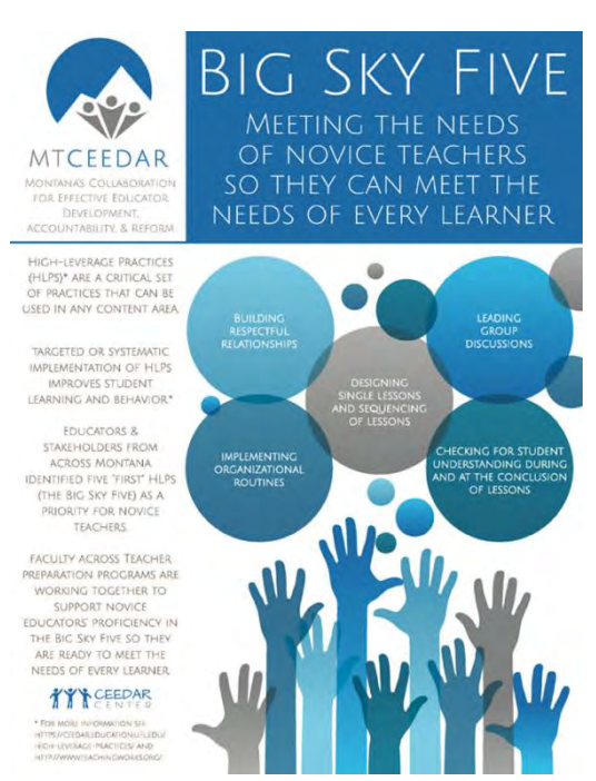
Big Sky Five Infographic