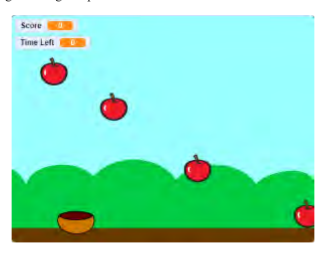
Figure 2. Example Scratch Activity

The following is an activity from the Scratch group. At the beginning of the activity, students were shown the screen in Figure 2. They were asked to create a game similar to the one shown in Figure 2. The bowl in the game can be controlled on the x-direction with the keyboard or the mouse. Apples spawn and fall down from random positions at the top. The player tries to take the apples. Each apple provides a constant point. There is a time limit in which the player tries to get the highest possible score.