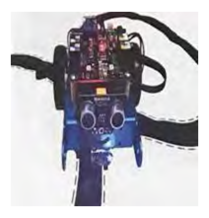
Figure 1. Example mBlock Activity

The following is an activity from the Scratch group. At the beginning of the activity, students were shown the screen in Figure 2. They were asked to create a game similar to the one shown in Figure 2. The bowl in the game can be controlled on the x-direction with the keyboard or the mouse. Apples spawn and fall down from random positions at the top. The player tries to take the apples. Each apple provides a constant point. There is a time limit in which the player tries to get the highest possible score.