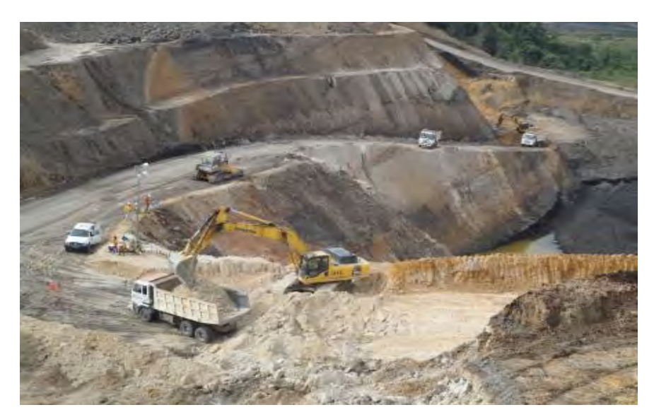
Figure 1. Roads condition in mining

Some of the observed teachers have already incorporated the principle of levels into their lesson plans by including problem-solving from the contextual/realistic level to the semi-formal level and then to the formal level. For example, in determining the gradient of a movement, students are asked to observe a picture of a winding road in a coal mining area. Then, the teacher asks if it is possible for a car at the bottom to climb up to the surface with a straight vertical path (informal level) shown in Figures 1 and 2.