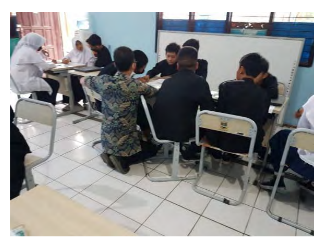
Figure 3. The teacher is providing guidance.

Based on observation, the guiding principle has been implemented by the teacher. In the guidance process, the teacher is seen actively approaching each group to ensure that they are working on exercises and providing guidance to groups experiencing difficulties. The teacher can be seen guiding one of the groups by sitting down with them to be on the same level as the students so that they feel comfortable and happy working on the problems (see Figure 3). It aligns with the research that stated RME can build students' happiness because RME motivates students to be active, creative, and encourage them to work together and communicate (Lesnussa, 2019).