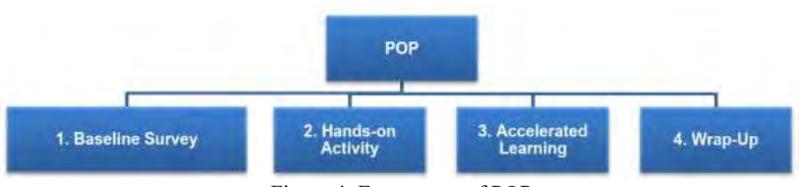
Figure 4: Four stages of POP

Step1. The first stage is known as Warm-Up/Teaser Test/Baseline Survey. At this stage, teachers challenge students with a question that is relevant to the topic. Students need encouragement to guess the lesson they are going to learn with the help of the baseline survey. This sort of challenging teaser test helps teachers analyse the level of their previous knowledge. Students are permitted to use notebooks or slates. If the question has options, teachers can adopt strategies such as yes-no response, clap up or down, stand up or sit down, show black side or white side of paper, etc. depending upon teachers' convenience and students interest. Here, teacher checks students' previous knowledge of the lesson he or she intends to teach. After doing this test, teacher can conclude what percentage of students has good knowledge. Teacher will keep record like 20%, 40%, 60% or 80%. If students' understanding of the first stage is less than 60%, the teacher has to do at least 3 activities to give students a very clear concept of the chapter he or she has planned to teach. So, this stage is very crucial.