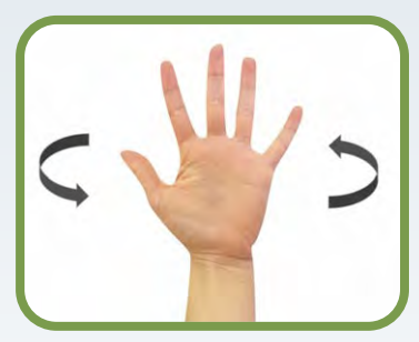
Above: This illustration shows the signed word for "tree." Top of page: Levels of educator support for language expression are shown here.

support: Response choices— The educator provides choices in response to a question that students can select from and repeat. For example, an