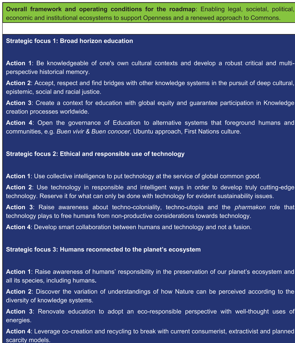
Figure 2 Roadmap for Open Education, situated at the epistemic level.

The roadmap for Open Education (Figure 2) addresses three major strategic focuses and a set of four actions for each of them. In addition, a supportive ecosystem is desirable for ease of deployment. The three main focuses are: i) broad horizon education; ii) ethical and responsible use of technology; and iii) humans reconnected to the planet's ecosystem.