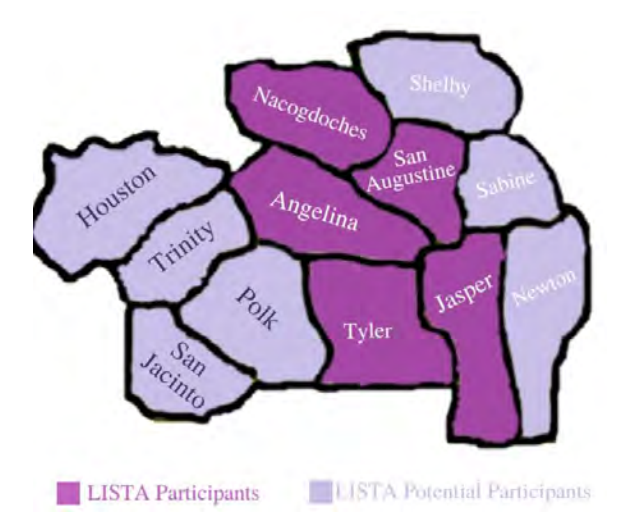
Note: The map above indicates where LISTA participants are employed by county.