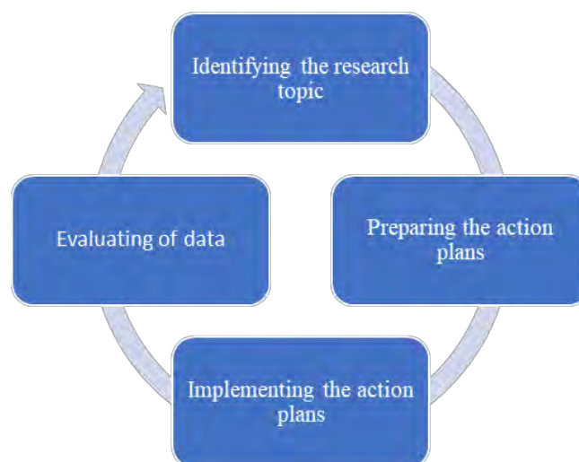
Figure 1. Action Research Process