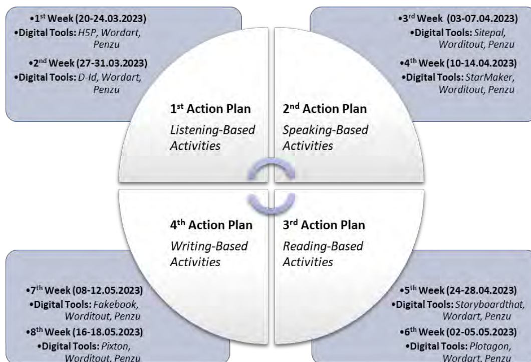
Figure 2. The action plan process of the research