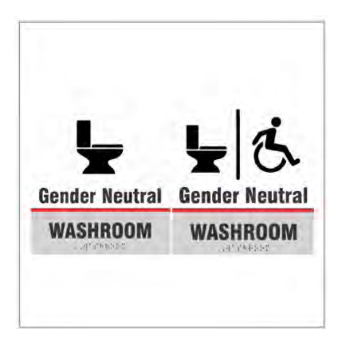
Figure 4 "Gender Neutral" Sign at the University of Guelph