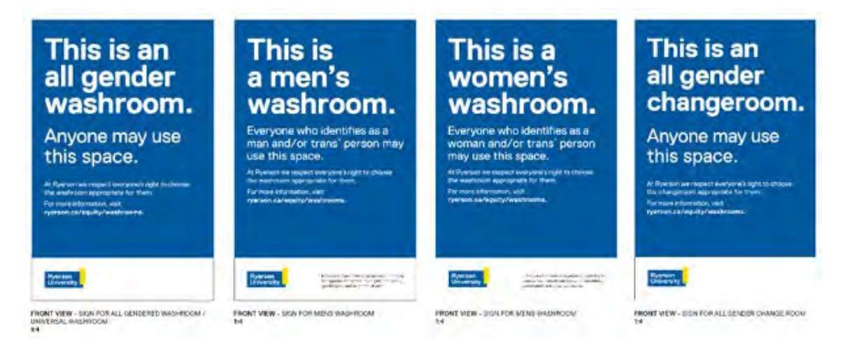
Figure 7 Posted Statements in/around Washrooms at Ryerson

Note: Sourced from Ryerson University (2019, p. 31), these posters demonstrate the inclusion of "trans*" individuals in all campus washrooms and changerooms.