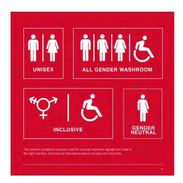
Figure 1 Incorrect (Identity-Based) Bathroom Signage for Gender-Neutral Washrooms

Note: Sourced from Entro (2016, p. 4) signage standards, these identity-based designs for gender-neutral washroom signage are to be avoided.