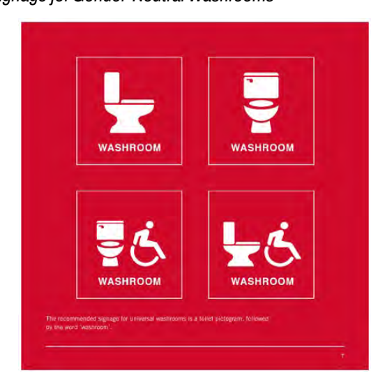
Figure 2 Correct (Use-Based) Bathroom Signage for Gender-Neutral Washrooms

Note: Sourced from Entro (2016, p. 7), these designs for gender-neutral washroom signage focus on the usage of space rather than the identity of the user.