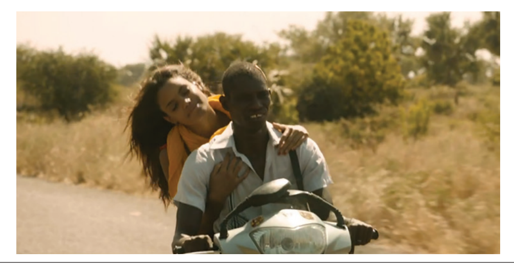
Figure 7. Mimi and Grigris: Liberation from heteronomy

in their films. Pudowkin (2003: 83) argues that every thought process consists of generating combinations and, therefore, that film montage should be understood as a form of reflection: