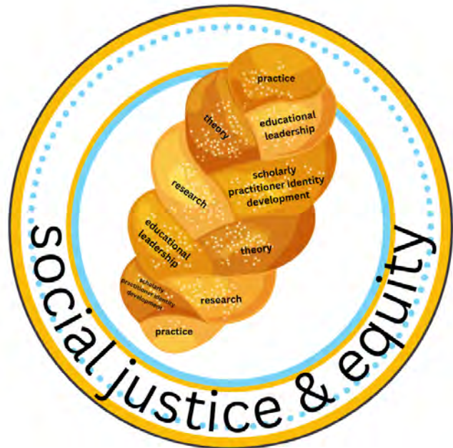
Figure 1. Conceptual Framework

As is true for most of my courses, I brought an inquiry stance (Cochran-Smith & Lytle, 2009) to my redesign of the course framed by essential questions: