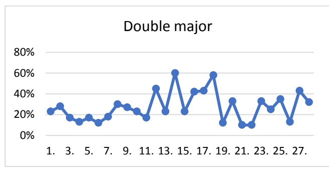
Figure 3. Results achieved in the initial test.