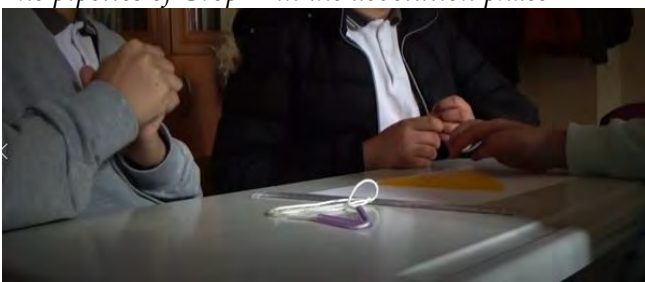
The pipettes of Grop A in the devolution phase

Based on their feedback, the researcher assumed the students understood the activity. When the students in Group A began the activity, it became apparent they did not understand they had to form a triangle with the two sides given. During the devolution phase, the researcher asked the students to measure the length of the two sides given as a rope and emphasized that a triangle should be formed according to these sides. Group A did not seem to pay attention to the instructions carefully when it came to forming a triangle according to the two sides provided, indicating that they did not listen to the researcher during the explanation. This may be due to the students not paying attention to the explanation, but rather to the activity materials in front of