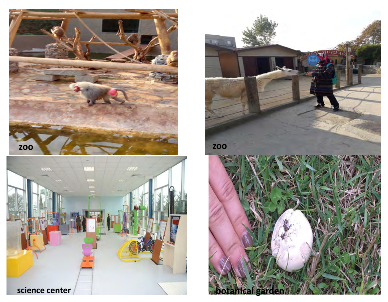
Figure 3. Examples of Outside School Learning Environments

Within the scope of the course, outside-school learning environments were introduced to teacher candidates, and information was given about the issues to be considered in outside school learning trips. Later, teacher candidates organized trips to different outside school learning environments such as botanical garden, aquarium, zoo, science centers, in which they took notes and prepared course plans. These trips were presented in class and course plans were discussed. Thus, science teaching and outside-school learning environments were correlated with experience.