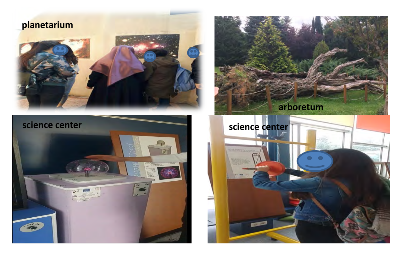
Figure 2. Examples of Outside School Learning Environments