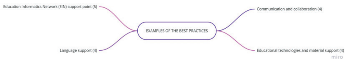
Figure 2. Best practices put into effect as the solution of problems encountered by refugee students in ODL

In the research, secondly, the question, “What are the practices developed to solve the problems encountered by the refugee students in ODL process, and how do you evaluate these practices?”, was asked to the participant teachers. The participant teachers’ views about this question were examined and the obtained themes and codes were indicated in Figure 2 below.