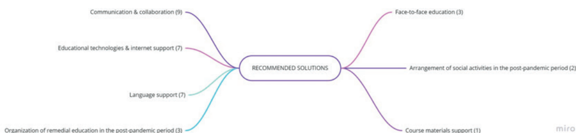
Figure 3. Solutions recommended to the problems faced by the refugee students in ODL

In the research, lastly, the question, "To alleviate the negative effects of the ODL process, what can be done about the education of refugee students?", was directed to the participant teachers. The participant teachers' views about this question were analyzed, and the obtained themes and codes were exhibited in Figure 3 below.