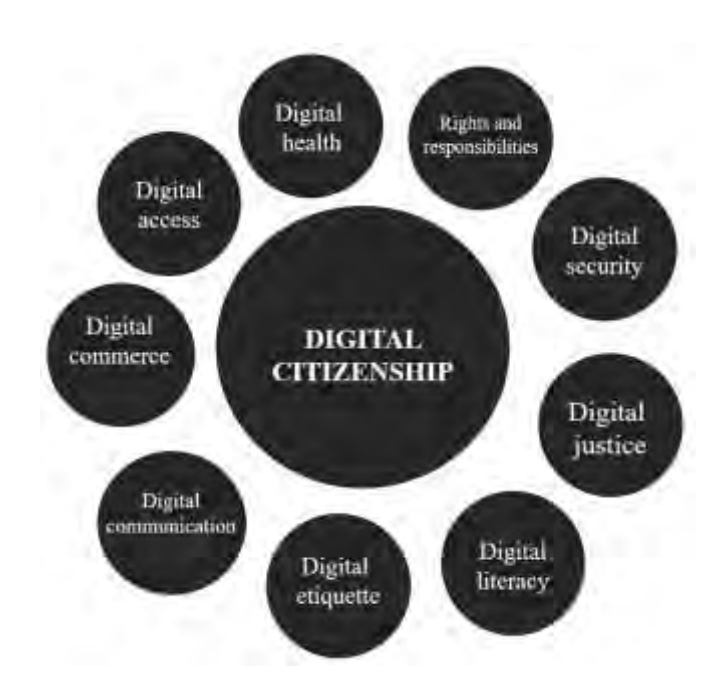
Figure 2. Ribble's theoretical model of digital citizenship (2015)

Digital justice aims to ensure that online activity is governed by rules and laws that are tailored to each problem in the digital world. Digital security is about security measures in digital contexts. The rights and responsibilities that users have online are freedoms they can enjoy in cyberspace, such as freedom of expression, participation in various activities, but also obligations to others (Ribble, 2015).