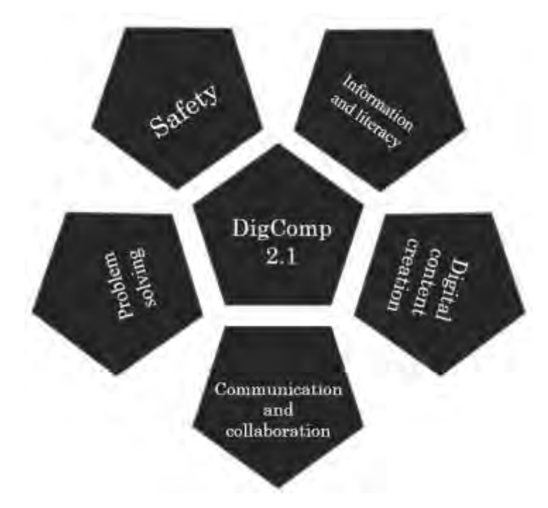
Figure 3. The five components of DigComp 2.1 (Carretero et al., 2017)

Digital justice aims to ensure that online activity is governed by rules and laws that are tailored to each problem in the digital world. Digital security is about security measures in digital contexts. The rights and responsibilities that users have online are freedoms they can enjoy in cyberspace, such as freedom of expression, participation in various activities, but also obligations to others (Ribble, 2015).