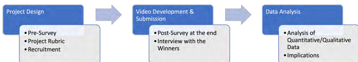
Figure 1. Project Timeline

The research activities outlined in Figure 1 were carried out between March 2020 and August 2020.