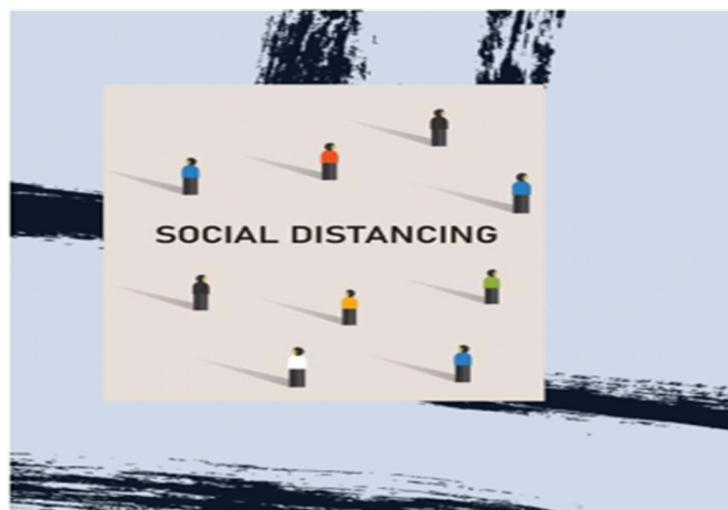
Figure 2. Social connectedness (SILL student's digital project, 2020/1)