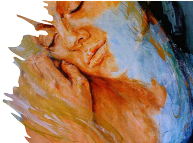
Figure 3. Being in touch with life (SIIL student's digital project, 2021/2)