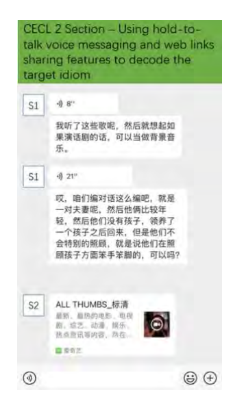
Figure 3. Using Music and Video Sharing Features