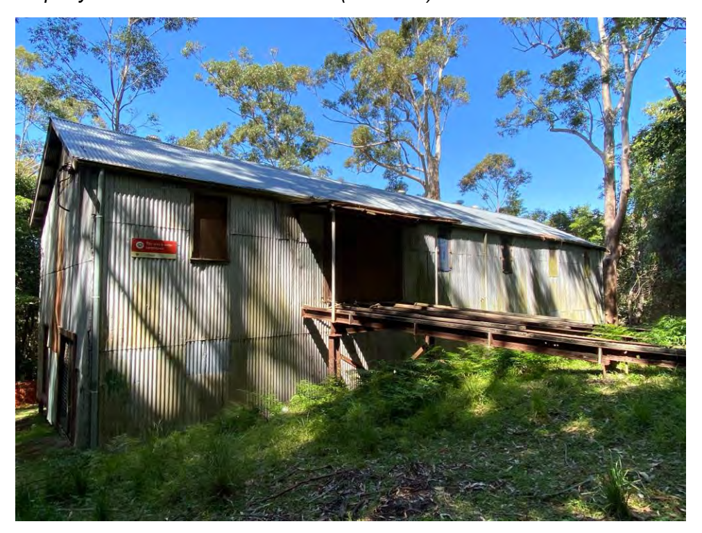
Figure 1 Pit pony stables at Mt Kembla Mine (Gill 2021)

Methodologically, we approach this study of fieldwork at and through Mt Kembla mine as a case study. The idea of a case is usually characterised as some sort of bounded entity or system (Patton, 2015) such as sites like Mt Kembla mine or an exercise such as the fieldtrip. As in the Mt Kembla fieldtrip, the content of a case study often evolves as the researchers' exposure to the case deepens (Stake, 2000). By assessing and reflecting on the fieldtrip over time through several sources we realise benefits of the case study approach such as perceiving "social networks and...complexes of social action" and the application of "the dimensions of time and history to the study of social life to bring out "continuity and change" (Orum et al., 1991, pp.7-6).