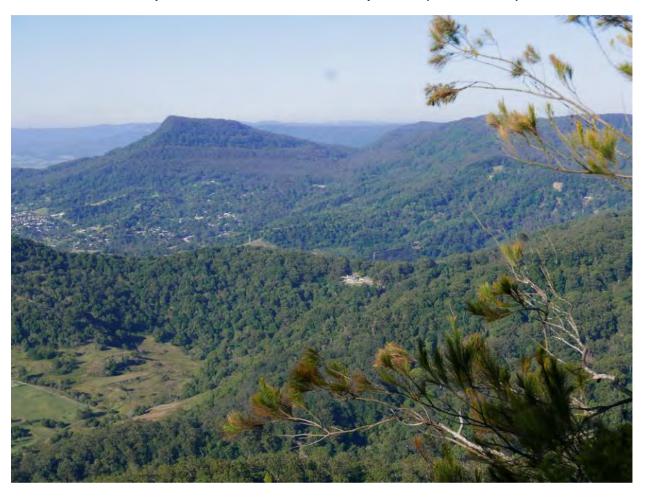
Figure 2 Mt Kembla and escarpment slopes from Mt Keira. The mine site is located approximately in the forested mid-slopes in the centre of the photo (Gill, 2023).

The mine site is now largely reforested and not readily discernible from the road. It is a difficult site for the NPWS to manage. Much of the four terraces that were created to house the mine and its infrastructure on the steep slope are difficult to move about on due to dense vegetation, erosion gullies, and the remains of infrastructure and equipment. The site is seen as unstable due to waste dumps and the steep slope. Surviving elements include the bath house slab, rail tracks, the explosives magazine, building footings, and items such as lamps and parts of coal skips. The only remaining buildings are the toilet block and pit pony stables.