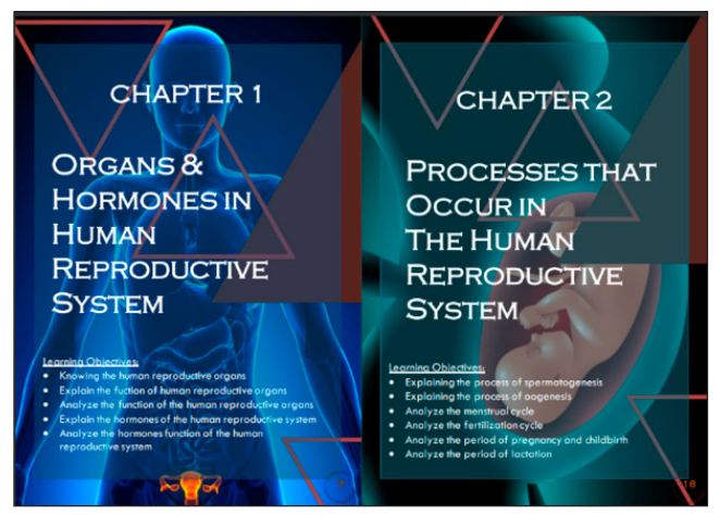
Figure 3. CLA Task-based Questions Page