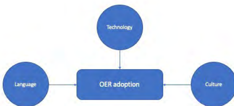
Factors Influencing OER Adoption