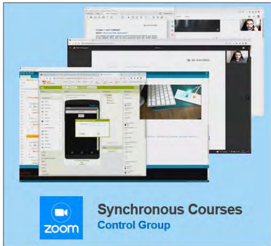
Fig. 1. A sample of weekly courses by groups.

The Internet of Things (IoT) training was delivered asynchronously via the Edpuzzle platform, where interactive training videos were presented in the experimental group. Edpuzzle is a Web 2.0 tool that allows you to create interactive videos by adding open-ended, multiple-choice questions to your videos (edpuzzle.com). In the control group, it was delivered synchronously through the Zoom application (zoom.us). In addition, Google Classroom was created to share course materials in both groups, and WhatsApp groups were created to maintain dialogue with students.