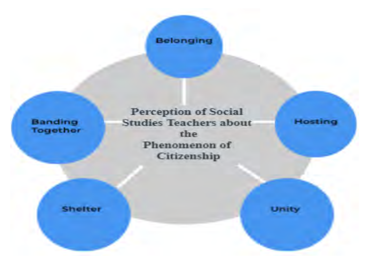
Figure 2. Findings reached within the scope of the perception of citizenship of the social studies teachers.

As seen in Figure 2, the findings reached in the research were combined under the themes of belonging, having a home, unity, shelter and banding together. The findings within the scope of these themes are as follows: