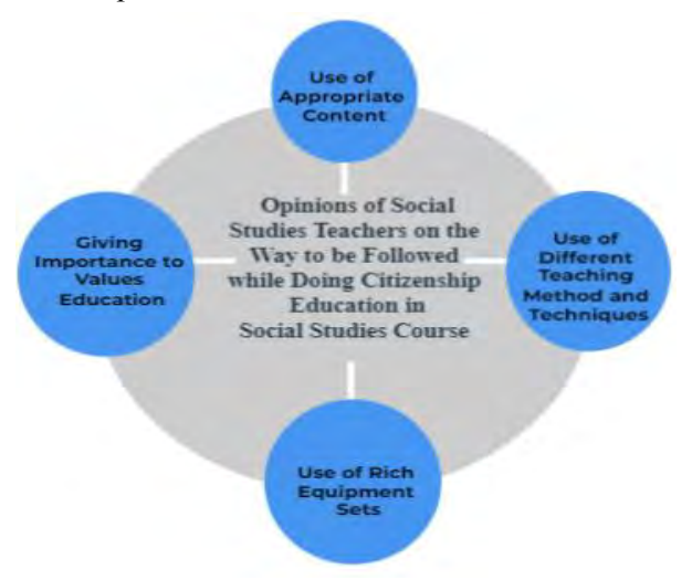
Figure 4. Findings obtained within the scope of the opinions of social studies teachers on the way to be followed in while giving citizenship education in social studies course.

As can be seen in Figure 4, the findings obtained within the scope of the opinions of social studies teachers on the way to be followed for citizenship education in the social studies course were combined under the themes of the use of appropriate content, the use of different teaching methods-techniques, the use of rich equipment sets, and the emphasis on value education. The findings within the scope of these themes are as follows: