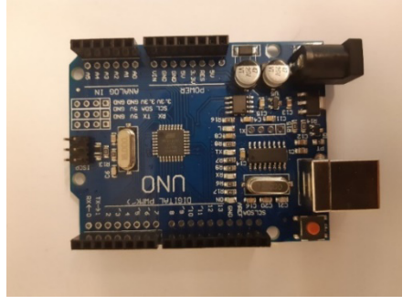
Fig. 2. The Arduino Uno computer.