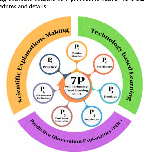
Figure 1. 7P POE Technology based Learning Model

1) Building and assessing suitability of the learning management plan of the learning management plan of the predictive-observation-explanatory (POE) technology based learning approach to promote scientific explanation making about the change of the substance for primary school students revealed that the researcher has designed the learning management plan of the predictive-observation-explanatory (POE) technology based learning approach to promote scientific explanation making about the change of the substance for primary school students for 3 learning management plans by spending the whole 3 hours for learning. The process in organizing learning activities consists of 7 procedures called "7P POE Technology based Learning Model" with following procedures and details: