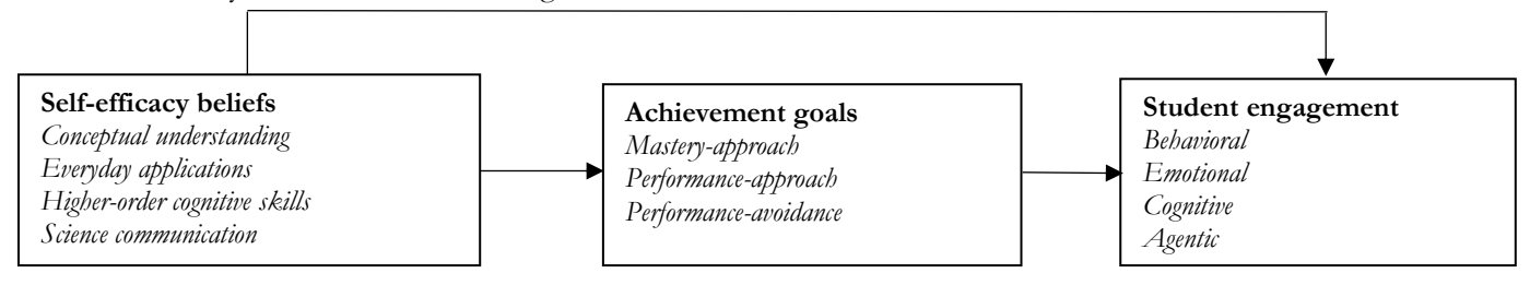
Figure 1 The relationship between study variables