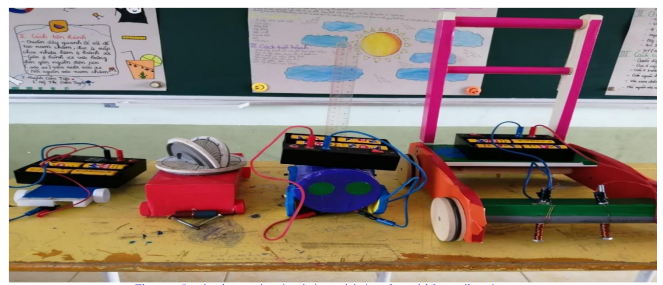
Figure 1. Stand – alone engineering design and design of a model for a nail suction cart. Source: Developed by Phu An Secondary School students in Binh Duong province, Vietnam.

The implementation process is an engineering design process that includes a few steps like asking questions; imagining the solution; making a plan; making product design; and improvement (Nanang Winarno et al., 2020). Of course, at the end of the process there is always a group sharing about developed products, receiving feedback from other groups and teachers. Studies have also found that engineering design activities can help the students become interested in STEM and develop skills such as creativity, critical thinking, collaboration, and communication as well as attracting STEM-related career choices (Peterson, 2020). However, this form of implementation has disadvantages in linking the learning phase of scientific concepts and applications, which can reduce learners' motivation to learn and orient the academic knowledge application into practice.