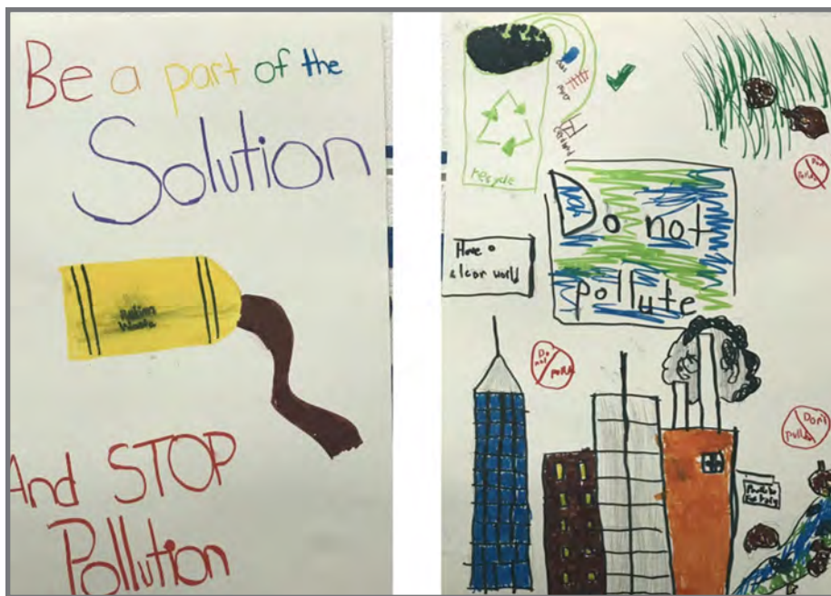
Figure 1. Two Pollution Posters Created by Students