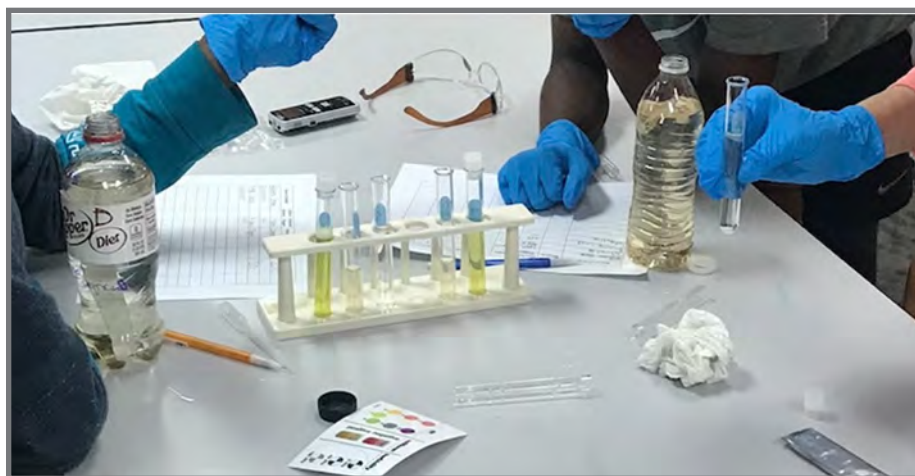
Figure 2. Students Testing the Water During a Lab Experiment

with whom students can connect, the illustrations showed sights they might see around town, such as culverts, waterways, and roadsides littered with garbage. To develop students' critical thinking skills and awareness of the importance of stopping pollution, we asked questions that connected the reading with their personal experiences: "Have you ever noticed any garbage on the ground when you were walking down the street or riding in a car? Is the garbage you saw a form of pollution? How can it affect our water?"