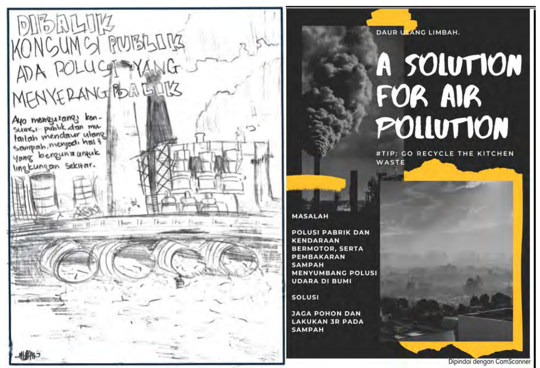
Figure 2. An example of a student poster about air pollution

thinking skills, such as incorporating activities to introduce sustainable living. One example is using digital technology such as the internet, online applications or platforms as a means to facilitate student learning. Digital technology is a positive approach in education for sustainability (Kuntsman & Rattle, 2019). Mobile digital devices as a new portable pedagogical tool have the potential to transform classrooms and enable new ways for students to connect to outdoor environments, empowering their access to different forms of knowledge and experience and enabling location-based learning (Lock & Seele, 2017; Hesselberth, 2018). In addition, online platforms can also be used to test student knowledge, for example with online sustainability literacy tests (Kuntsman & Rattle, 2019).