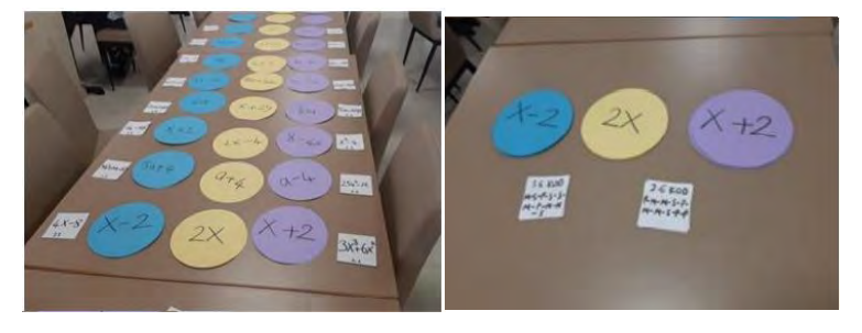
Figure 1. A Game Sample Designed For the 8th Grade

As it can be seen, two of the games were on the 5th grade level, 4 of them on the 6th grade level, and 3 of them are 7th and 8th grade level. One of the games designed for 8th grade is seen below.