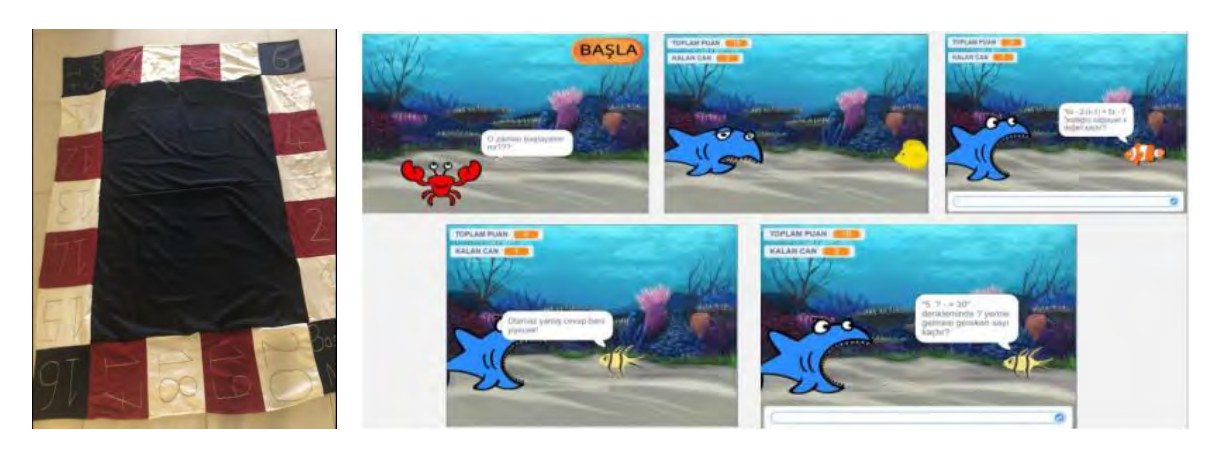
Figure 5. A Game Sample Designed For 7th Grade

answer they say. The one who complete the racetrack first wins. Then they move on to the Fish Grabber game, which was developed using the Scratch program. The game begins with the instruction to start. The crab character informs about the game. When the game starts, a shark waiting for small fish appears. The small fish asks questions and expect their answers. These questions must be answered until they go near the shark. The groups receive points according to their correct/wrong answers, and the group with the highest score wins the game.