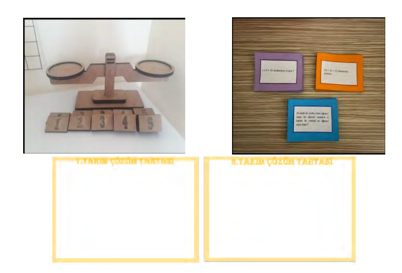
Figure 8. Visual From A Game Developed For Reinforcing The Topic Of Equality And Equation

In this game played as groups, 2 students draw cards and try to solve the question on the solution board while 2 other students try to model this question on a weighing scale. Therefore, the aim is the active participation of all group members. Among the groups that are scored separately for the problem solving and modeling on the weighing scales, the group with the highest score wins the game.