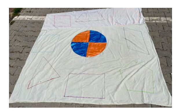
Figure 3. Visual From The Game Find The Polygon

As it is seen, games were developed in the learning areas of numbers and operations (n=6), algebra (n=5), and geometry and measurement (n=1). In the field of numbers and operations, games on natural numbers, operations with natural numbers, fractions, operations with fractions, exponential expressions, square root expressions, multipliers and multiples sublearning areas have been developed. On the other hand, while algebraic expressions, equality and equations, and linear equations were central in the area of algebra learning, the only game in the field of geometry and measurement learning was developed on polygons. The visual of the Find Polygon game can be seen, which is a game aiming students to find the polygon suitable for the given property and reach the correct polygon as soon as possible.