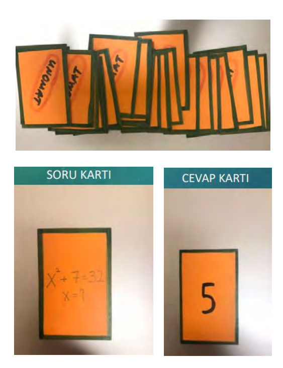
Figure 4. A Visual From The Game Unomath

From these games developed as a card game, in Unomath, 8 cards are distributed to each person. After each player receives their cards, a person selected randomly starts the game throwing a question card. If the player does not have a question card in her hand at the beginning, he/she draws a card from the card deck in the middle a question comes, and then throws the question card. It is now the player in the right's turn and he/she tries to throw the answer. The game continues in this manner. The game also includes handover, joker, direction change, pass, and ban cards. In this way, the game enhances the student's mathematical skills.