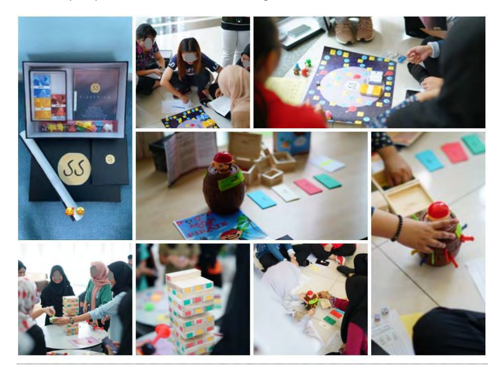
Game Play Day: Students as Innovators through Creative Collaboration

The gamification project required students to form a group of 6-7. Each group was required to choose one of the three topics on (1) signs and symptoms of LD, (2) national and international declarations of support for persons with LDs, and (3) intervention strategies in reading and writing for children with SLDs. All groups chose to remain in the same group for the field trip and the gamification project.