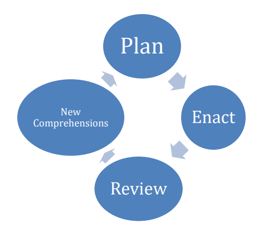
Figure 2: Model of Technological Pedagogical Reasoning for a South African Rural Teacher

Finally, TPR is not a phenomenon only focused on teachers but learners as well. There has been criticism of models of pedagogical reasoning as being only teacher centered. This criticism fails to recognize the inherent purpose of TPR, which is to design and create meaningful learning experiences for learners. Thus, TPR results in new comprehensions, a common feature on all models of pedagogical reasoning, in new knowledge, attitudes, and skills (KAS). The intended outcome is the creation learning environments that support learners' understanding of scientific concepts by appropriating the affordances of digital technology. For South African rural teachers, TPR can be conceptualized as having the following phases: Plan, Enact, Review, and New Comprehension. These phases are depicted in Figure 2: