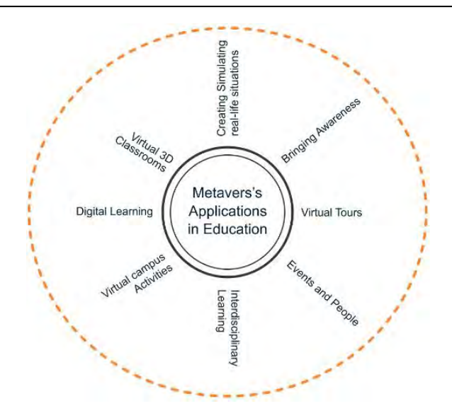
Figure 2. Several ways in which the education sector leverages the benefits of the metaverse