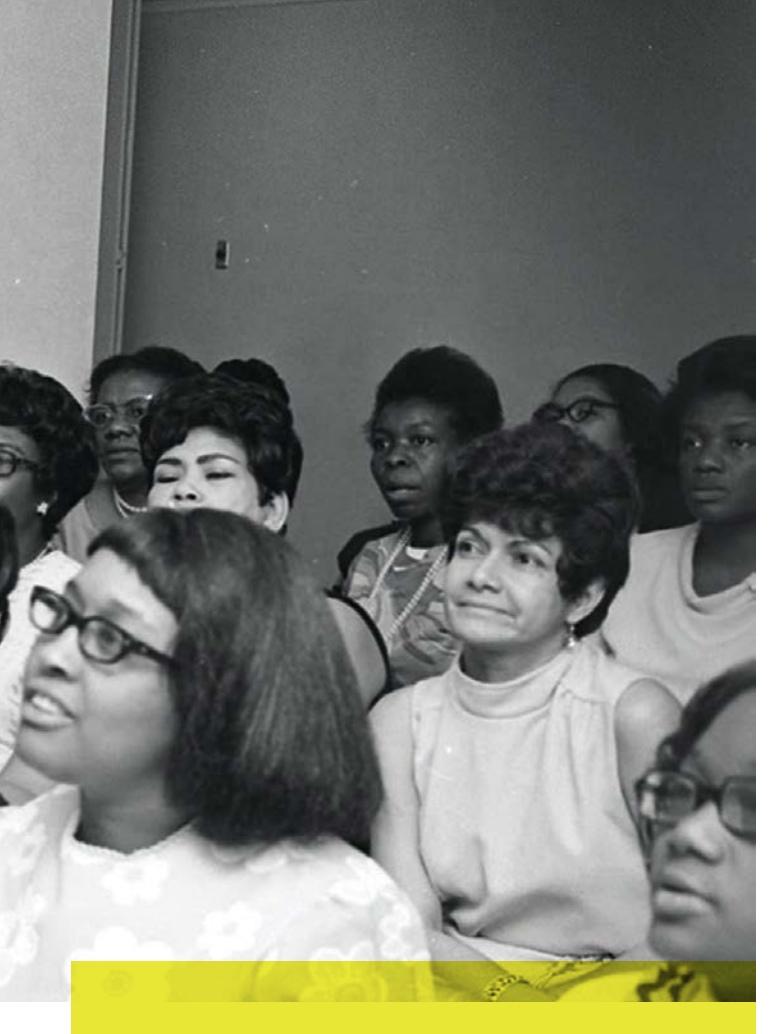
Paraprofessionals, who were members of the United Federation of Teachers, taking a high school equivalency exam in Manhattan in 1970.

The promise of a "career ladder" was why many paraprofessionals—then as now, primarily working-class Black and Latina women—applied for these jobs. When training did not materialize, the struggle for opportunities was a key reason paraprofessionals organized with AFT locals in the late 1960s and the 1970s. By 1975, pipeline programs had been established through AFT advocacy and bargaining in cities across the nation.