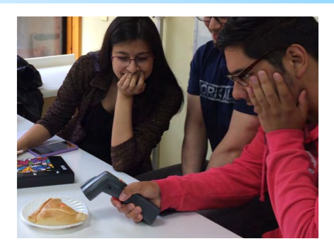
Figure 1. Experiment on the cooling of an empanada (meat pie)

During the experiment field notes were taken in which pre-service mathematics teachers' interactions were recorded, including their dialogs and specifically the diverse forms of reasoning and heuristics that came about when solving the problems. These notes were taken as internal records initially in order to later compile a more detailed description of the results. Additionally, the solutions to the problems, hand-written on sheets of paper by the pre-service mathematics teachers, were collected as documentary records.