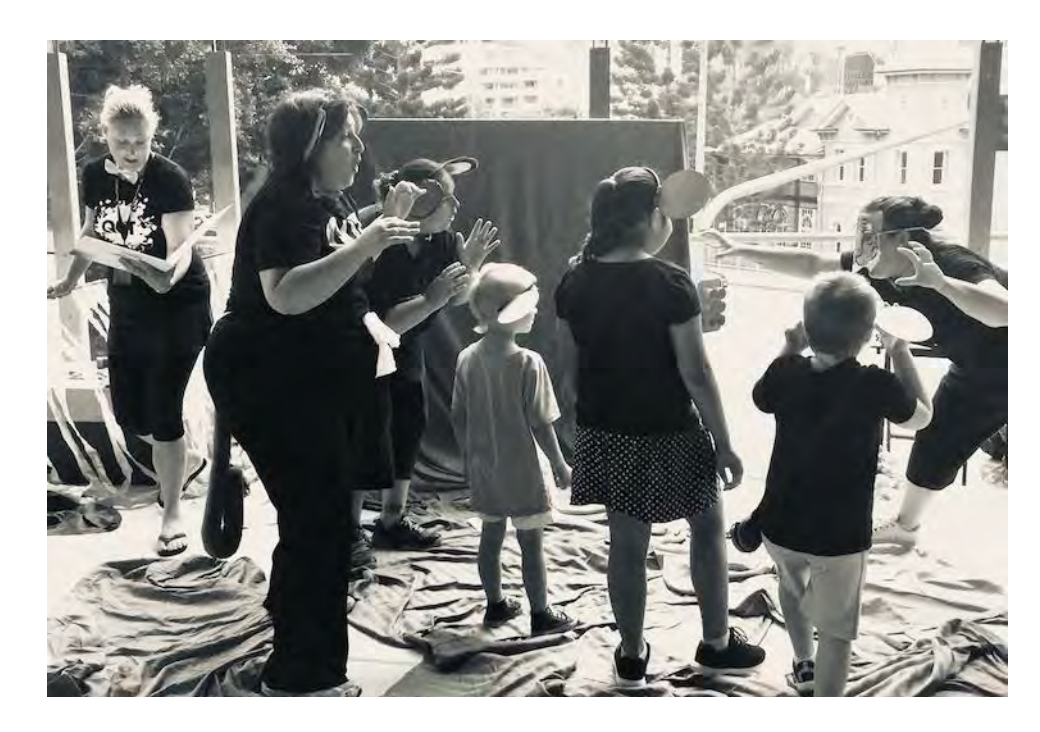
Figure 2. Student teams creating dance works with children at the Creative Currents festival.

The Creative Currents festival enabled the education students and children to work intergenerationally to experiment with diverse concepts of identity and urban citizenship. These rich themes allowed critical investigation of ideas and assumptions about bodies, identities, and urban communities and environments. The theme facilitated positive explorations of how and why bodies are different, and how these different bodies meaningfully contribute as citizens to urban communities. The theme explored the possibilities for belonging, living, dwelling in the city and the local environment, and who and what is a citizen? The intergenerational creative works imagined more-than-human citizens, where might they live, what would their neighborhoods look like? The children, hospital staff, and university students were moving together as they collectively learned more about identity and imagined these possible urban citizenships. A little after the festival children wrote reflections that captured the residual ideas and thoughts from the day. A particularly powerful reflection which read "My dream was to fly like a bird and it happened today" (Figure 3.) conveys the effectiveness of intergenerational movement for opening children up to big ideas about identity and community.