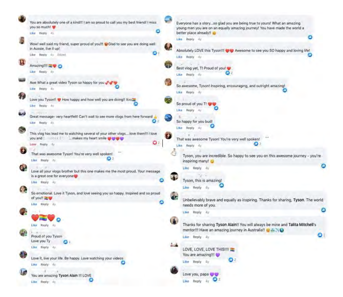
Figure 4. Screen grab from social media, November 2017.