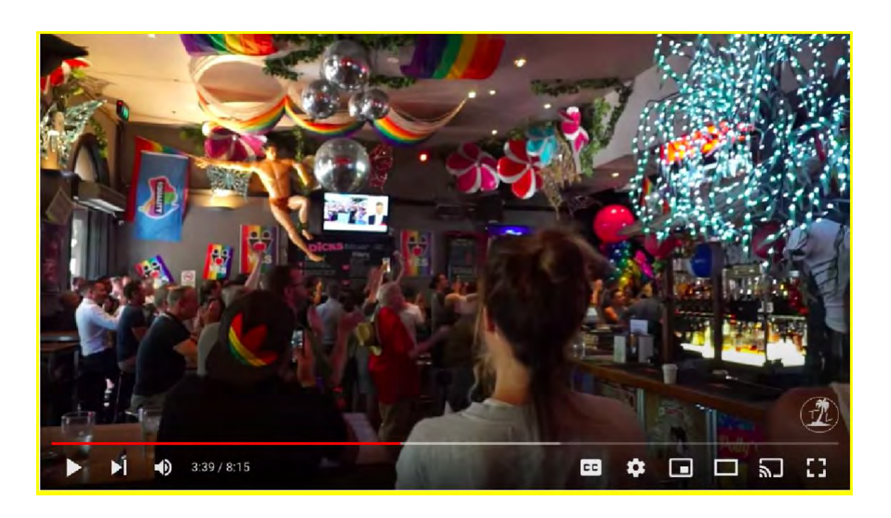
Figure 3. Still image from vlog. Sydney, November 2017.

I walked in...and stood in the corner waiting for the announcement. I could feel the tension in the room and my palms grew sweaty as I tried to steady my camera. I wasn't watching what I was filming; I was watching the couple beside me. Two handsome men, embraced with their arms around one another, stood watching the TV. When the 61.6% announcement boomed across the room, it shot in a sea of emotions with it. This couple hugged so tightly it looked as though they were gripping one another for support not to fall almost as though the two shall become one. They sobbed uncontrollably, tears streaming down their faces—it was impossible for me not to stare...That day altered my perspectives of being gay and fighting for equality—it is human rights, not gay rights (Lepage, 2019, p. 79).