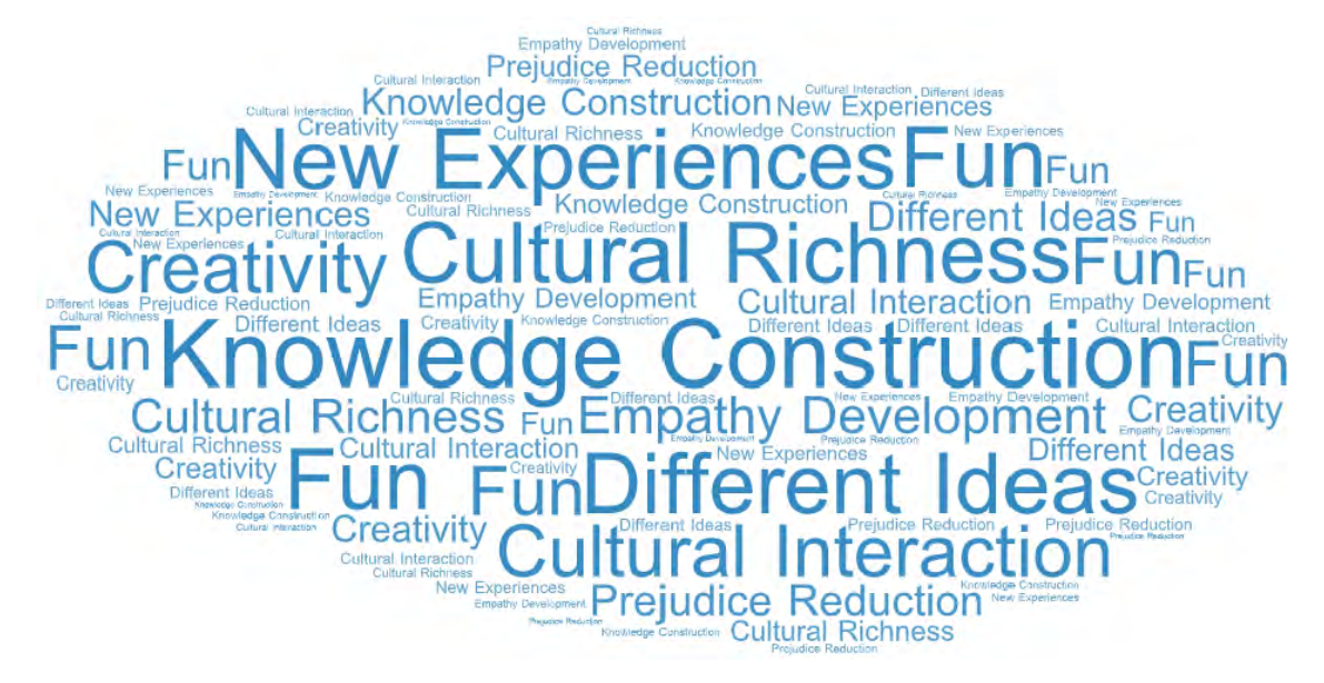
Figure 2. Codes associated with the strengths of cultural diversity

In the first sub-problem of the research, the teachers' views on the strengths of cultural diversity and the codes obtained are shown within the word cloud created as in Figure 2 (all word clouds created on www.wordart.com).