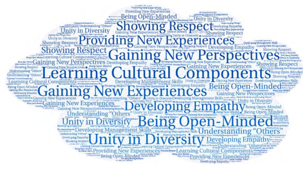
Figure 6. Codes associated with the opportunities for cultural diversity

In the third sub-problem of the research, the teachers' views on the opportunities for cultural diversity and the codes obtained are shown within the word cloud created as in Figure 6.