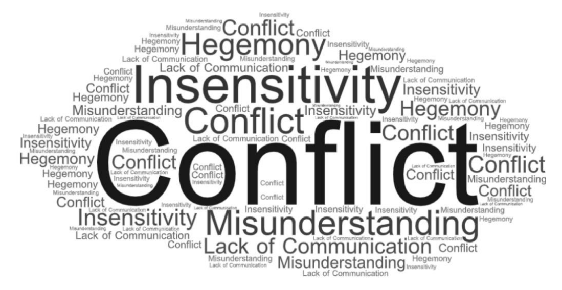
Figure 8. Codes associated with the threats against cultural diversity in the classroom

In the fourth sub-problem of the research, the teachers' views on the threats against cultural diversity and the codes obtained are shown within the word cloud created as in Figure 8.