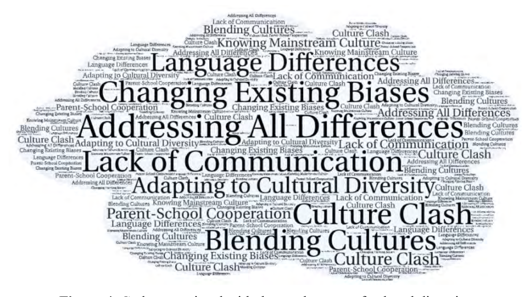
Figure 4. Codes associated with the weaknesses of cultural diversity

In the second sub-problem of the research, the teachers' views on the weaknesses of cultural diversity and the codes obtained are shown within the word cloud created as in Figure 4.