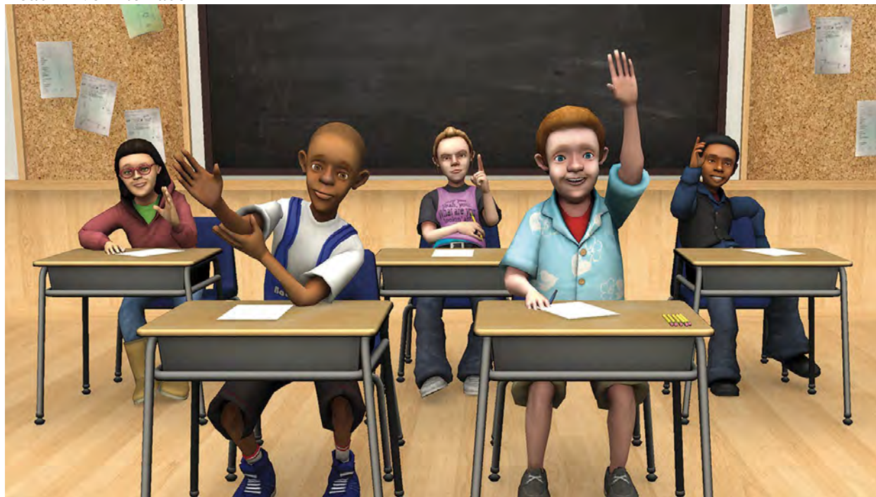
Figure 2 TeachLive Interface