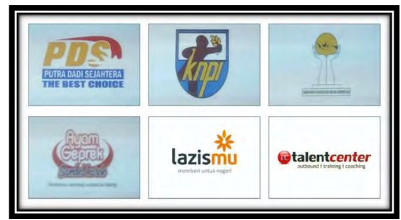
Figure 2 Logo of the Main Sponsor of the Sragen Business School