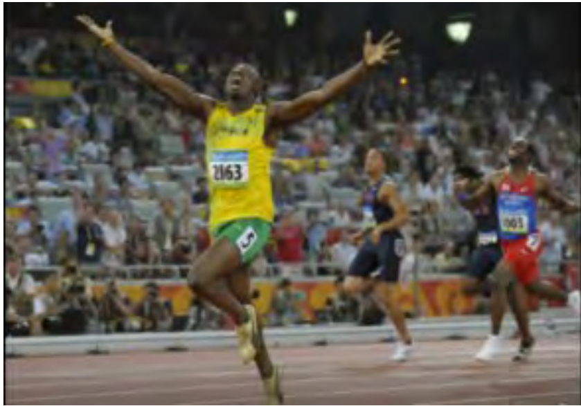
Image of a Winner in a Running Race

Note. It appears from 4:53 to 4:57. The transcript reads, “So the arms up in the V, the chin is slightly lifted.”