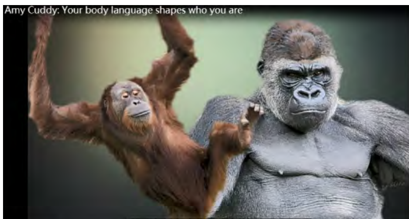
Image of Participants with Expanding Gestures