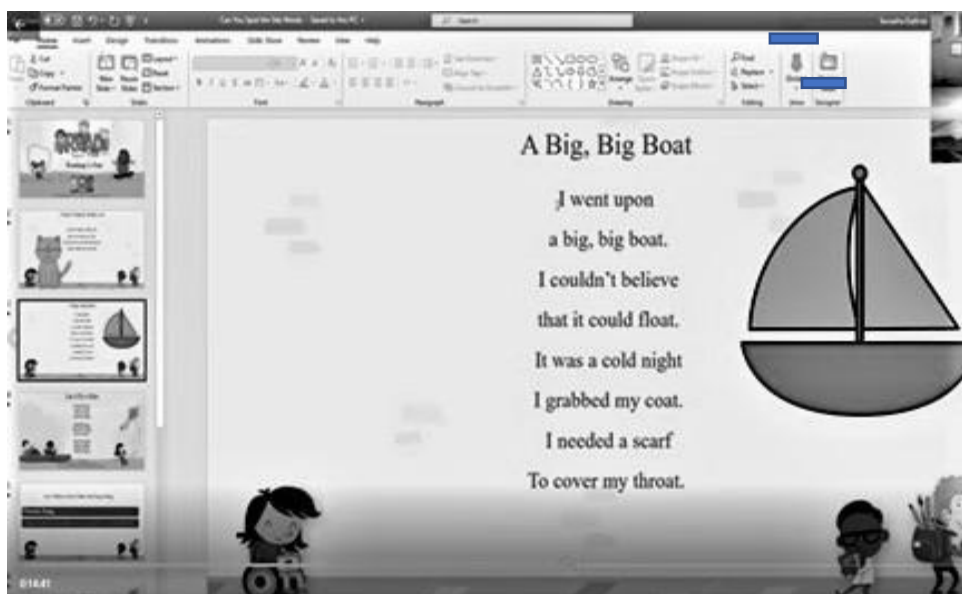
Figure 1. Tracy's Use of PowerPoint with Multimodal Resources

Brittany also employed multimodal resources when she engaged her EB student and parents in family literacy bag activities. The EB family collaborated multimodally through speaking, reading, and writing in both English and their home language, drawing and crafting, and gesturing to communicate. In this translinguaging space, multiple modalities were combined to help the EB learn new words and develop an understanding of the text.