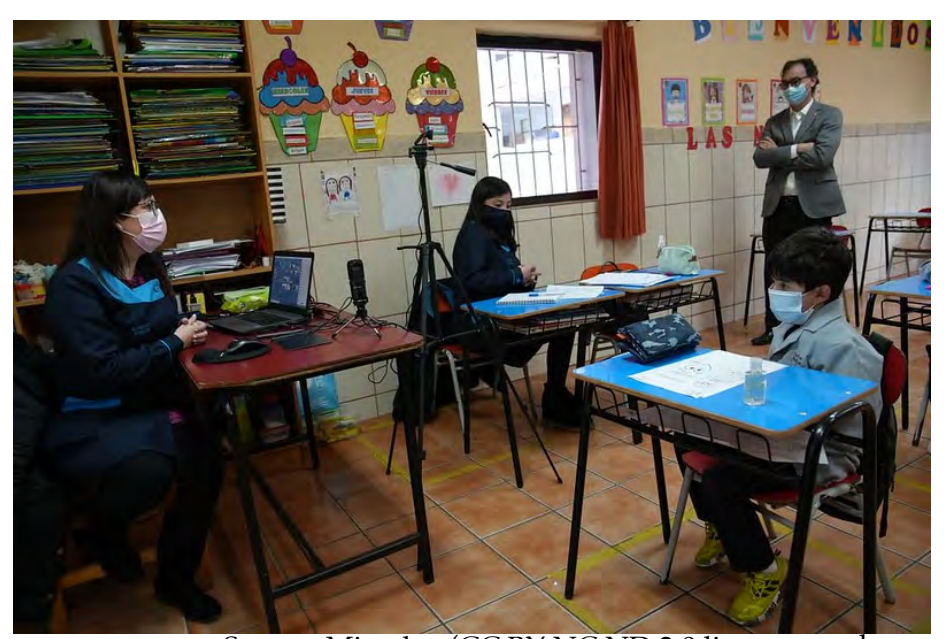
Figure 4 Minister of Education Raúl Figueroa in 2021 visiting a school in Valparaíso, where only some students were taking in-person classes