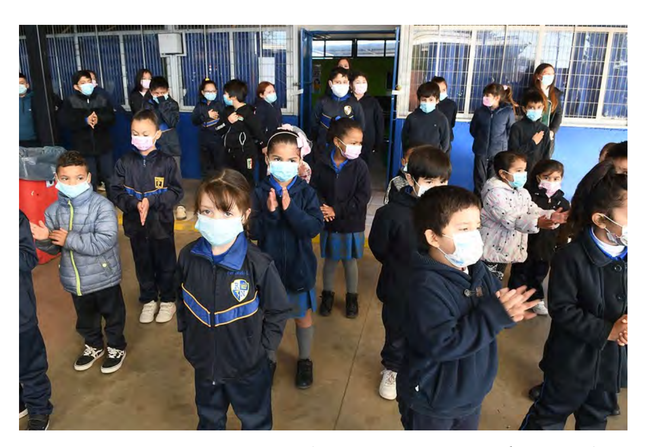
Figure 1 Students at Colegio Reina Norte in Santiago in 2021, after the school reopened