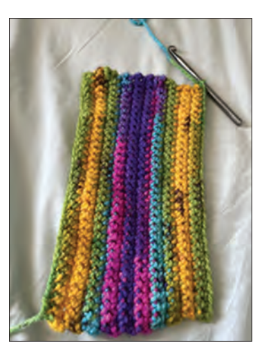
Figure 2: The Carpet

York, et al.: Crochet: Engaging secondary school girls in art for STEAM's sake