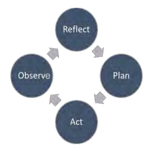
Figure 1. Action Research Process