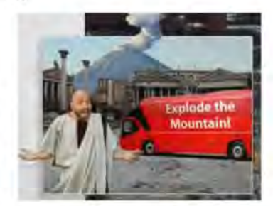
"Brexit is basically Pompeii, if the citizens voted for the Volcano"