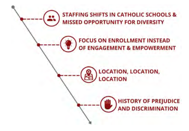
Figure 1 Historical Factors Driving Low Hispanic Educator Representation

Today, 29.1 million Hispanic Catholics (about 47% of all Hispanics self-identify as such) constitute about 41.6% of the nearly 70 million Catholics in the United States (Smith et al., 2019). These numbers suggest that the future of Catholicism in this country will be significantly defined by Hispanics. In 2016, the National Catholic Education Association (NCEA) reported that 7% of all faculty (including full-time and part-time teachers and leaders) in Catholic schools self-identified as Hispanic (McDonald & Schultz, 2016). That percentage increased to 9% (14,612) in the 2020–2021 academic year (McDonald & Schultz, 2021). The Cultivating Talent report provides a closer look at who Hispanic teachers and leaders are in Catholic schools, how they enrich these institutions with their presence and their work, the challenges they face, and how these schools support their flourishment.