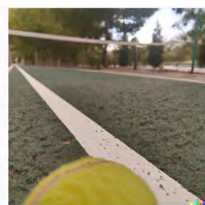
Figure 21. Tennis game