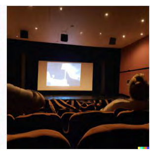
Figure 25. Watching a movie at the cinema