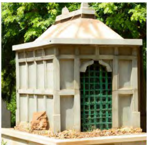
Figure 27. A tomb