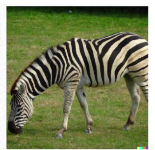
Figure 5. A zebra in a meadow