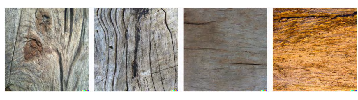
Figure 13. Tree pattern