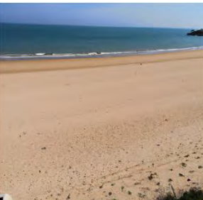
Figure 8. A beautiful sea and a beach