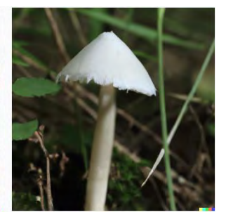
Figure 17. A mushroom

In the Nature category, when the "a pine tree", "red roses", and "a mushroom" images created by artificial intelligence are examined, all of the images created are quite lively and colorful. However, it is noteworthy that some of the tree images have disruptions or blurriness. In addition, the fact that the tree and mushroom images were created with different angles and compositions can also offer different options for the person who will benefit from the image. All images created in the Nature category are suitable for the text.