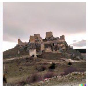
Figure 28. A historical castle