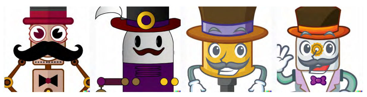
Figure 31. A robot with a hat and mustache, smiling