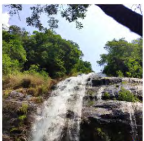
Figure 9. A waterfall surrounded by trees