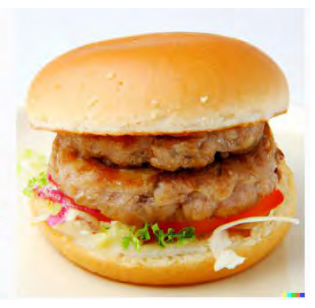
Figure 18. A hamburger