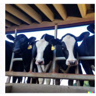
Figure 6. Cows on a farm

Upon examination of the images of animals produced by artificial intelligence in the "Animals" category, all of the "a domestic cat", "a zebra in a meadow", and "cows on a farm" images are smoothly formed and produced without any striking distortion. At the same time, these images are lively and aesthetically pleasing and are produced in a manner consistent with the text. However, some zebra images show zebras extending out of the frame. This problem can be eliminated by selecting all the visible images instead of those in this form.