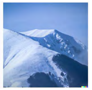
Figure 7. Mountains covered in snow