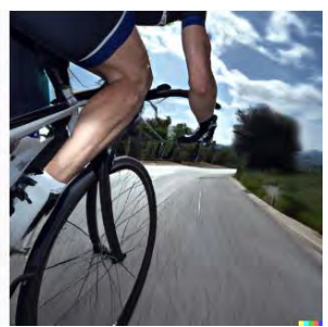
Figure 23. Bicycle riding

When the "tennis game", "football game", and " bicycle riding" images created by artificial intelligence are examined, it can be said that they are all lively images in terms of color. However, in the soccer-related image, there is a poster-style content in a different language and deformities in human figures. However, both soccer and bike images show overflows outside the screen. Therefore, by providing explanatory inputs to the artificial intelligence tool on this issue in the images to be used, such a problem can be prevented.