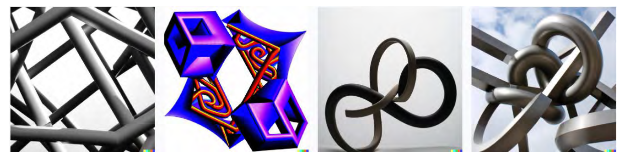
Figure 14. Intertwined geometric figures

When examining the "tree pattern" and "intertwined geometric figures" images produced by artificial intelligence, it is possible to say that the liveliness and clarity of the tree patterns are somewhat low, although it can also be stated that this is also due to the type of pattern desired. On the other hand, it can be said that the images related to geometric shapes are quite lively and aesthetic. In addition, all images have produced results that are consistent with the text, and there has been no distortion.