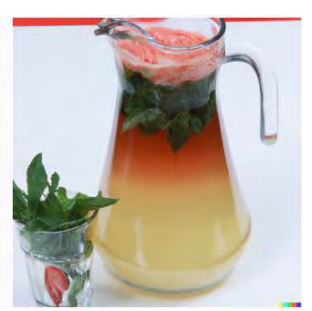
Figure 19. A jug of fruit juice