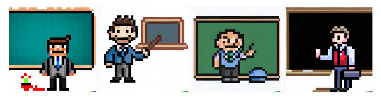
Figure 32. A pixelated blackboard and teacher in the style of a Mario game

When the images of "a wolf and a rabbit watching the sunset together", "a robot with a hat and mustache smiling", and "a pixelated teacher and blackboard in the style of a Mario game" created in the category of absurd images are examined, it is seen that all of the images have a text-appropriate and correct output. However, it is seen that the wolf and rabbit images are more in the style of animation graphics, and the robot image is in the form of a drawing. The pixelated teacher image in the Mario style is very successful and exactly as desired.