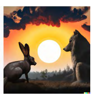
Figure 30. A wolf and rabbit watching the sunset together